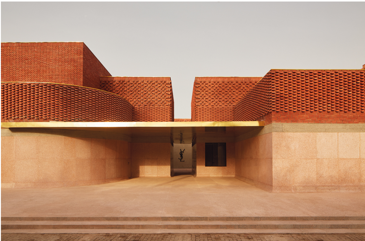
Yves Saint Laurent Museum entrance in Marrakech