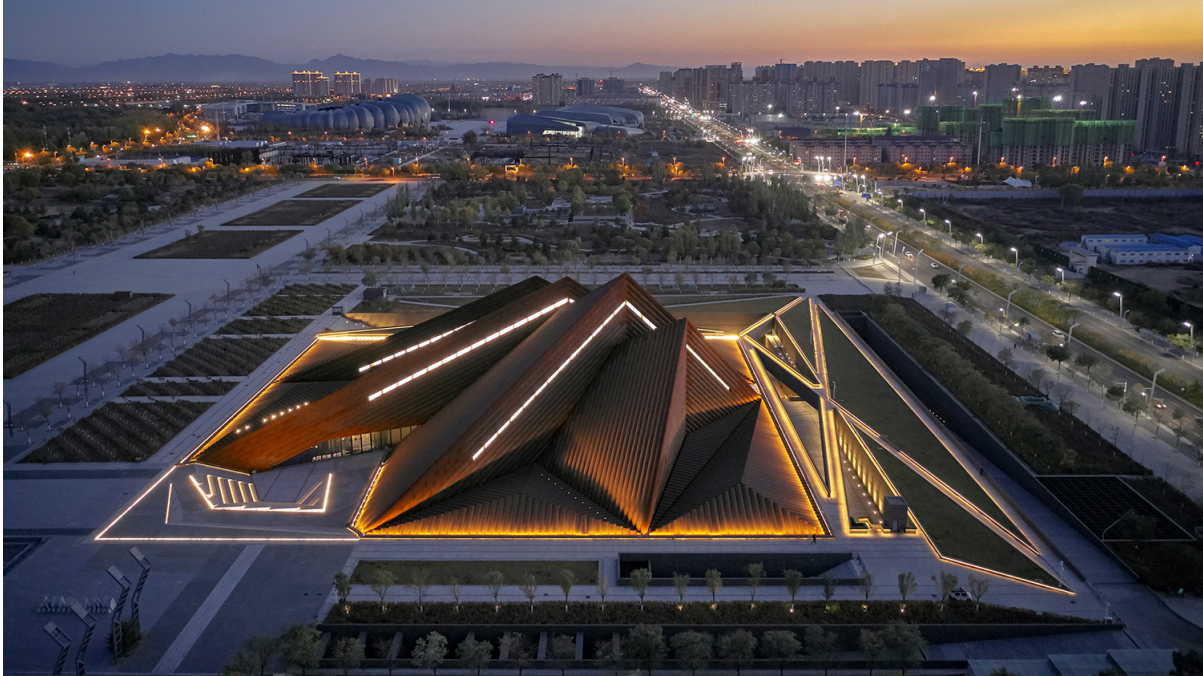
Datong Art Museum by Foster + Partners.

unique prints made at the visionary print studio Two Palms. Prices range from $1,000–$40,000. —Lucy Rees