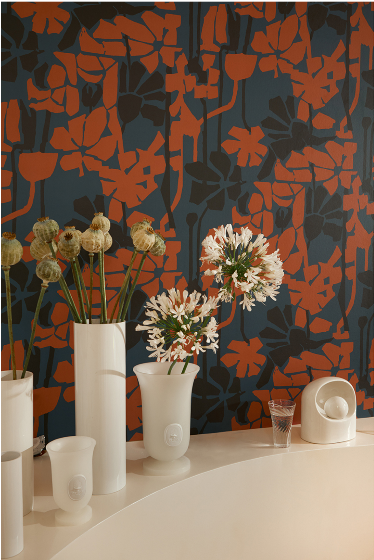
Diptyque's Sarayi wallcovering design.