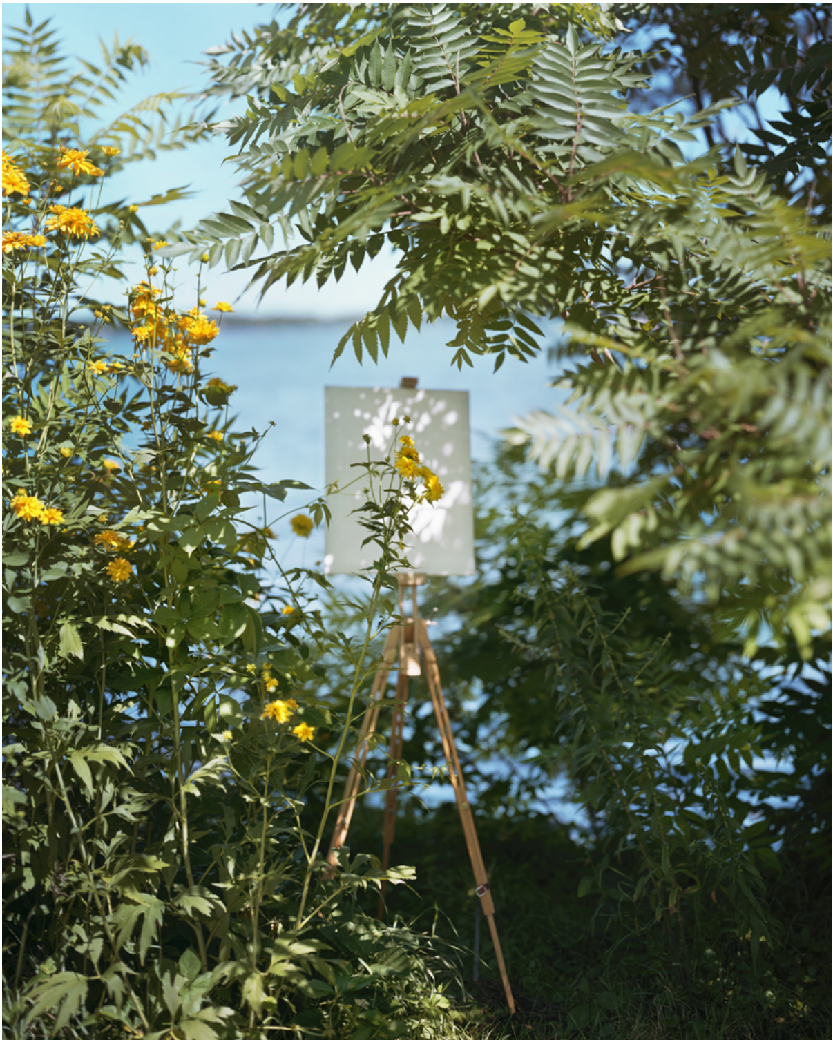
White Bear Lake, Minnesota (2019) by Alec Soth Photo: Alec Soth