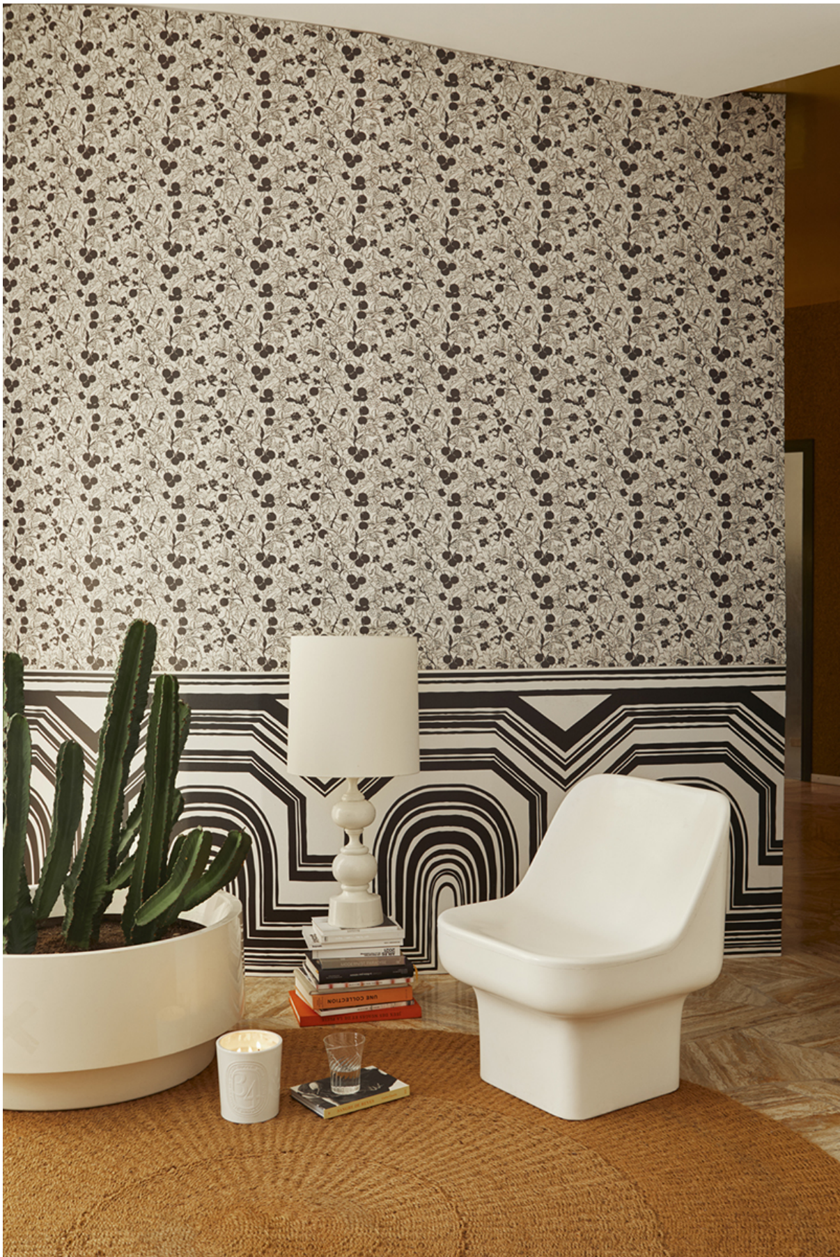
Diptyque Boscage and Basile pattern wallcoverings.