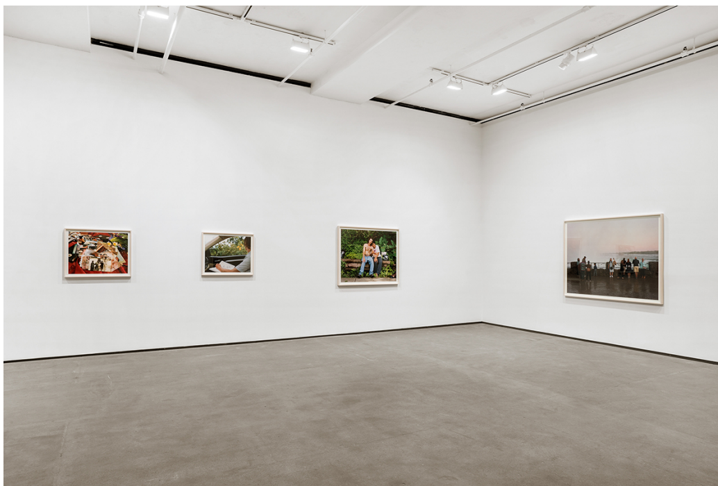
Installation view of Alec Soth: A Pound of Pictures at Sean Kelly, New York January 14 – February 26, 2022