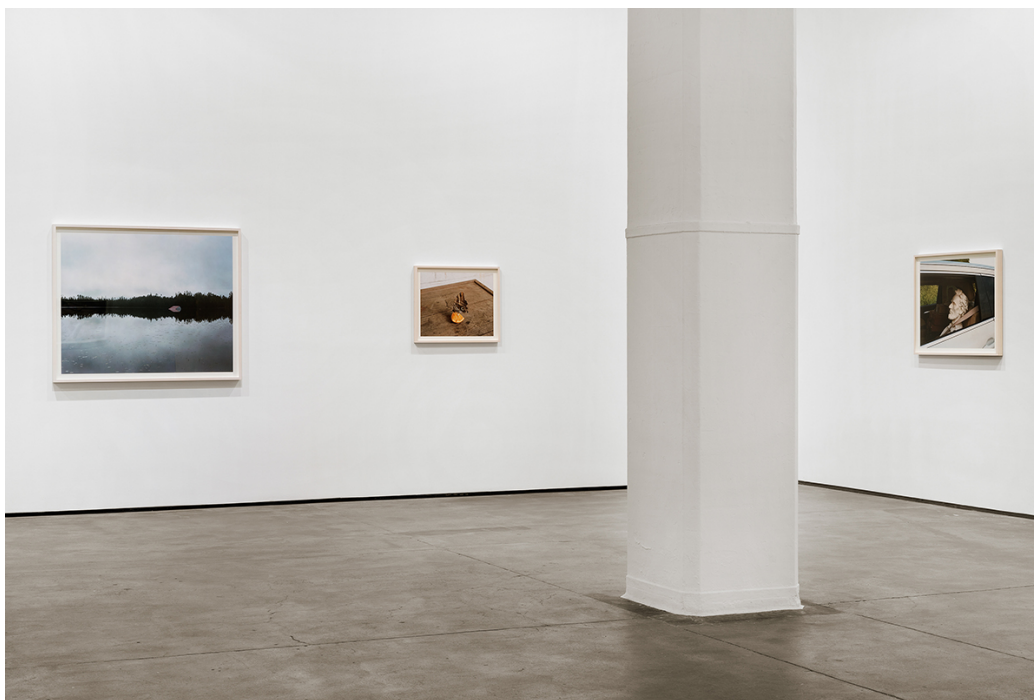
Installation view of Alec Soth: A Pound of Pictures at Sean Kelly, New York