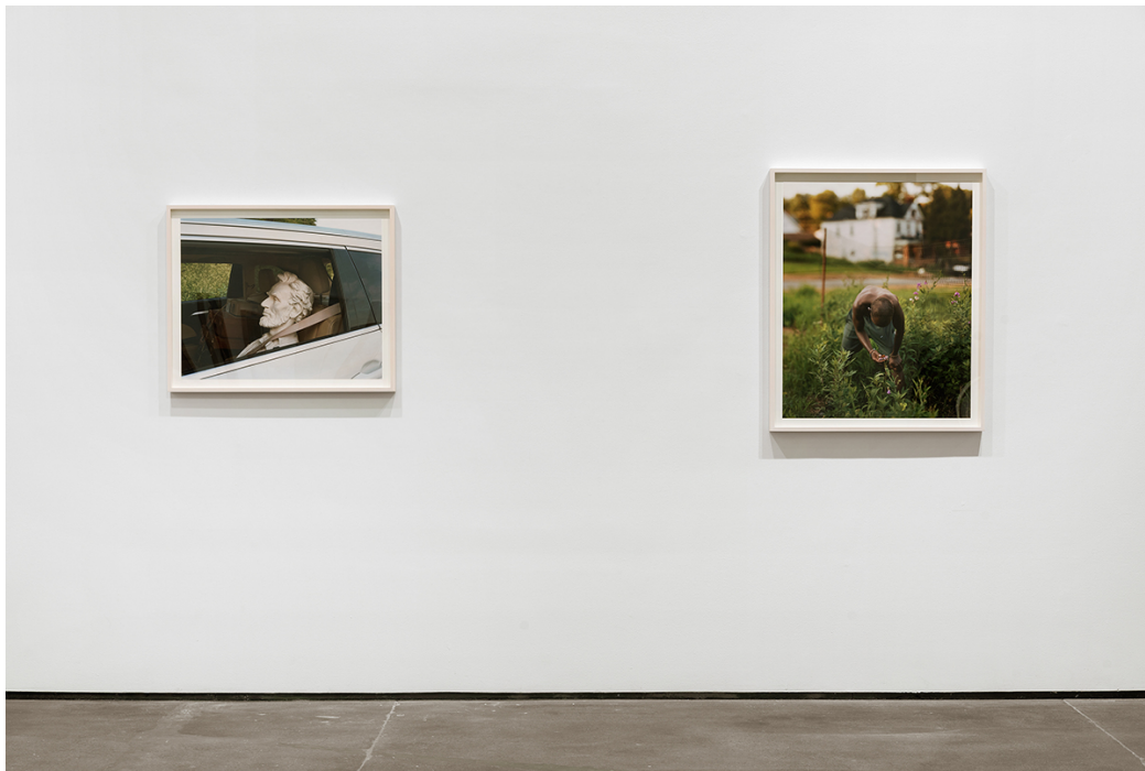
Installation view of Alec Soth: A Pound of Pictures at Sean Kelly, New York January 14 – February 26, 2022