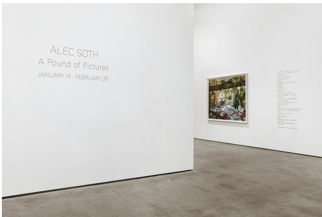
Installation view of Alec Soth: A Pound of Pictures at Sean Kelly, New York January 14 – February 26, 2022

Mining the history of his own oeuvre, from the first major series, Sleeping by the Mississippi , to more recent images, A Pound of Pictures , becomes a deeply self-reflective interrogation of Soth's entire body of work.