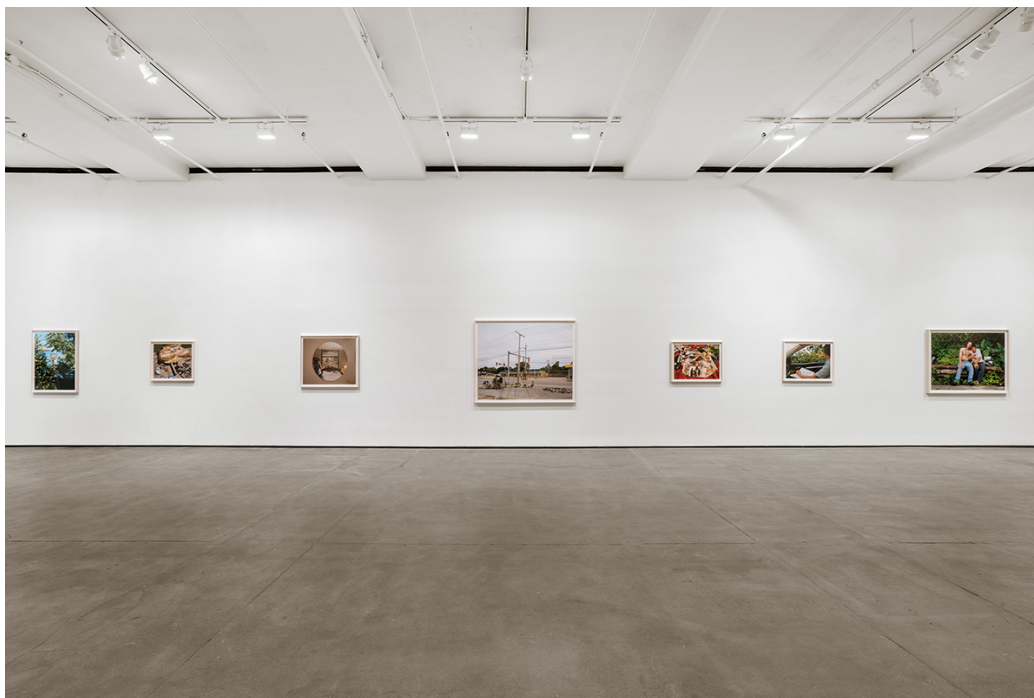
Installation view of Alec Soth: A Pound of Pictures at Sean Kelly, New York January 14 – February 26, 2022