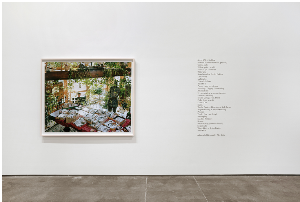
Installation view of Alec Soth: A Pound of Pictures at Sean Kelly, New York