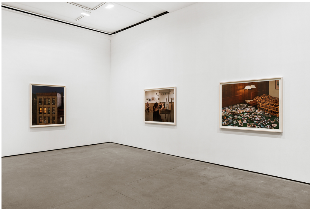
Installation view of Alec Soth: A Pound of Pictures at Sean Kelly, New York January 14 – February 26, 2022