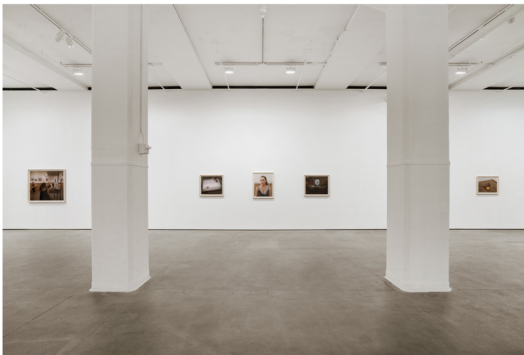
Installation view of Alec Soth: A Pound of Pictures at Sean Kelly, New York January 14 – February 26, 2022