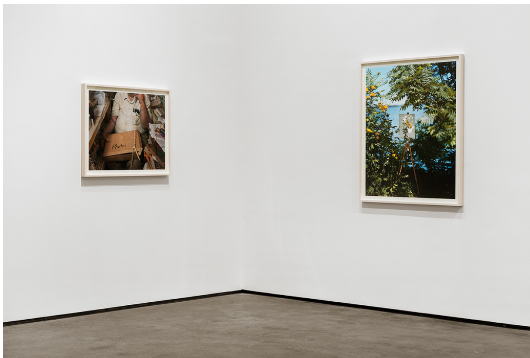
Installation view of Alec Soth: A Pound of Pictures at Sean Kelly, New York