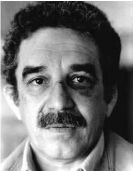
Gabriel García Márquez, 1976