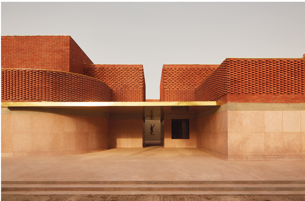
Yves Saint Laurent Museum entrance in Marrakech