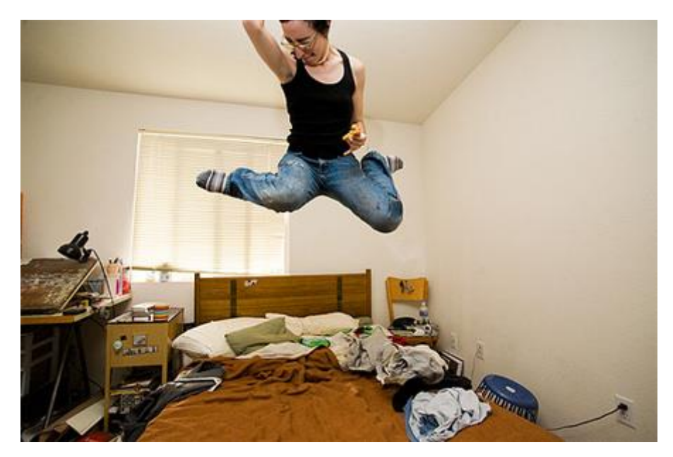
Monte Cristo sandwich plus Foreigner's "Juke Box Hero"