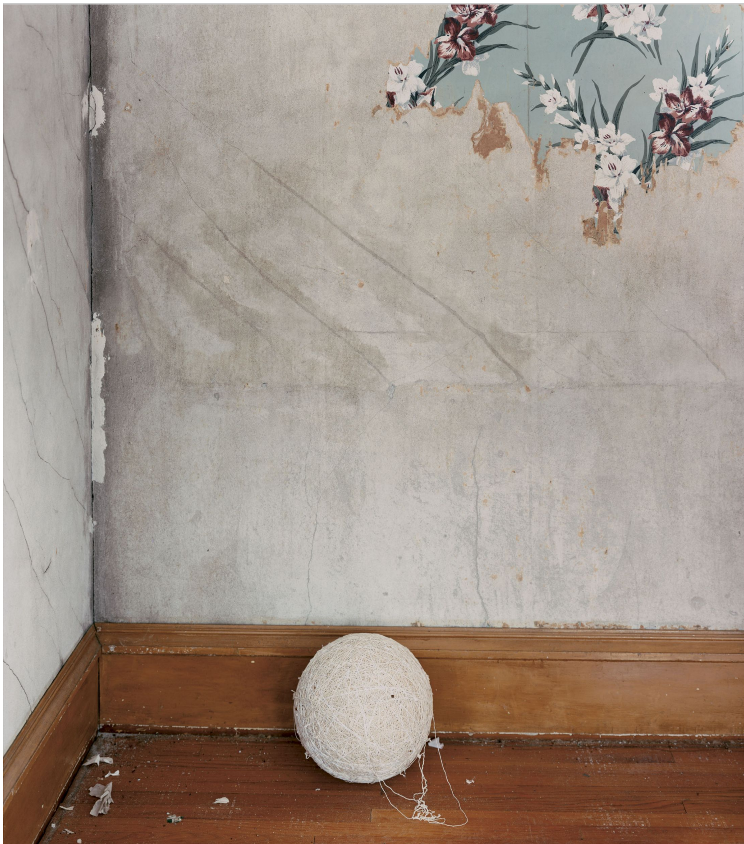
Green Island, Iowa (Ball of String), 2002