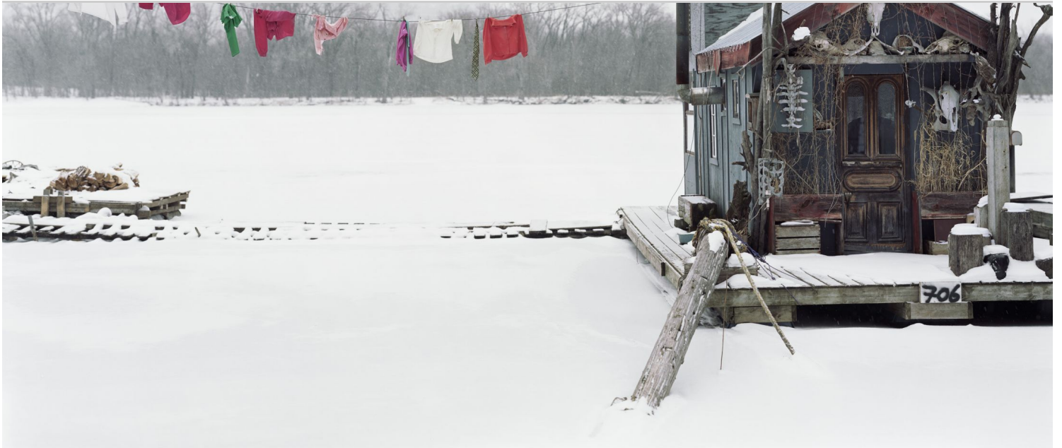
Peter's Houseboat, Winona, MN, 2003